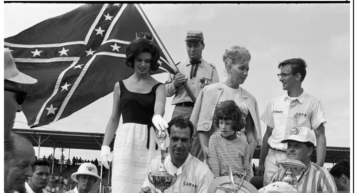
Ned Jarrett in Victory Circle at the Southern 500 at Darlington, SC Sept. 6th, 1965

This is back when Nascar still knew it's Southern Roots, and the drivers were real men! Nascar-go back to your Southern Roots, embrace the flag, and watch your attendance grow again!