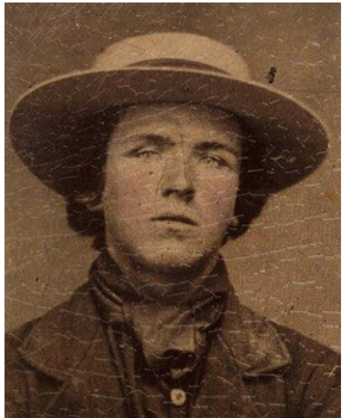
William Clarke Quantrill

While this photo was on last months cover, I realized too late it printed too dark and it could barely be made out. So here you can see it well via the E News!