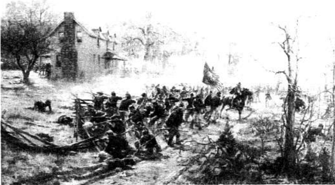
Battle of Prairie Grove, Arkansas

On December 3rd and 4th will be the reenactment of the Battle of Prairie Grove. The Battlefield park contains over 900 acres and many original structures. It's one of the few reenactments that occur on an actual Battlefield.