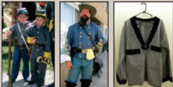
James Country Mercantile researches for the most authentic patterns possible, including the Frank James Guerrilla Shirt, featured right.